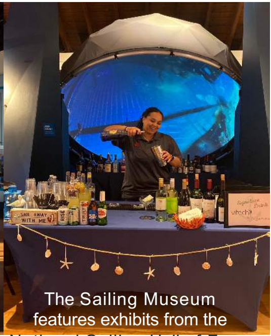
The Sailing Museum features exhibits from the National Sailing Hall of Fame & America's Cup Hall of Fame